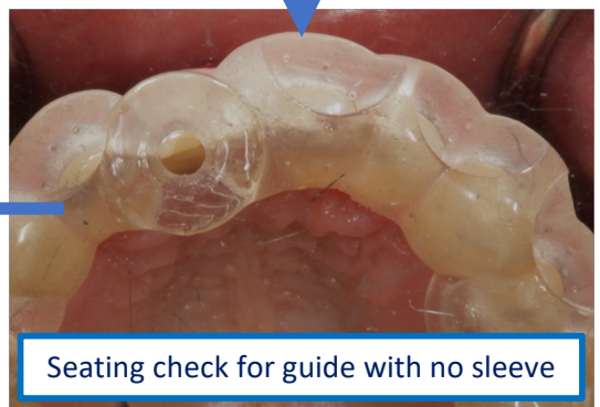
Seating check for guide with no sleeve

Resultant undesired distal channel to desired patent apical third of canal